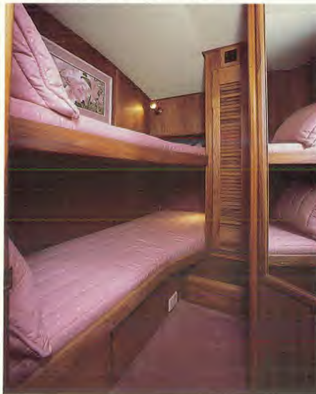
Guest Stateroom —2 Stateroom Model