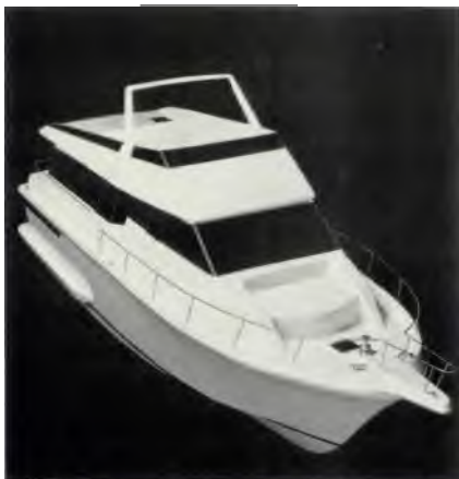
THIS NEW VIKING OFFERS THE MOST USEABLE SPACE OF ANY 50' MOTOR YACHT.

With the 50', Viking brings all of its legendary luxury, style, performance and construction technology to the mid-size range, creating a whole new class of motor yacht. There's nothing like it.