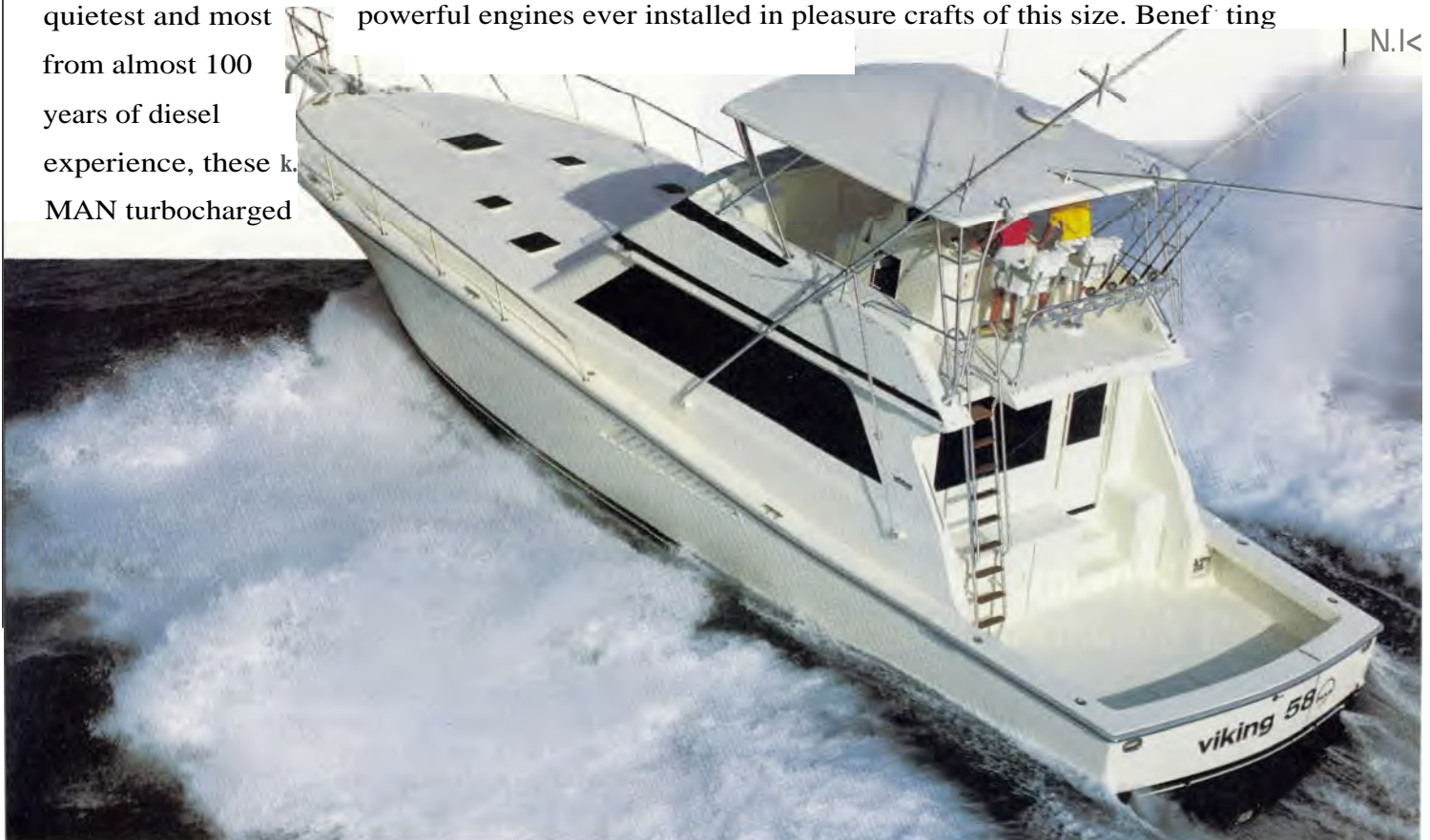
THE VIKING 58'C. A YACHT THAT GIVES TRUE MEANING TO THE TERM, "WORLD-CLASS."

Secured to Viking's engine mounting system are two of the smoothest, quietest and most powerful engines ever installed in pleasure crafts of this size. Benefiting from almost 100 years of diesel experience, these k. MAN turbocharged