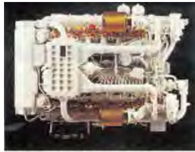
1100 HP 12-CYLINDER TURBOCHARGED, MAN 2842

To create Viking Convertibles, Viking assembled a team of the finest manufacturers of marine components—from throughout the world.