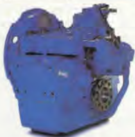
ZF MODEL BW 165P-2

diesels couple the highest power-to-weight ratio with low maintenance, outstanding economy and unfailing reliability. The MANs deliver their enormous power smoothly, reliably and efficiently through a world famous ZF Marine transmission. This quest for perfection continues with the use of computer-customized, Super Thrust propellers.